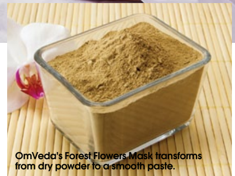
OmVeda's Forest Flowers Mask transforms from dry powder to a smooth paste.

Dermalogica Power Recovery Therapy is an intense wrap dedicated to feeding the skin with nourishment. The unique blend of wheat protein and honey act as maximum hydrators whilst the wasabi, ginger and white tea help to stimulate blood circulation to promote healthier